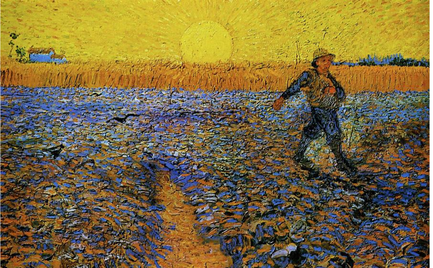
The Sower by Vincent van Gogh, 1888.